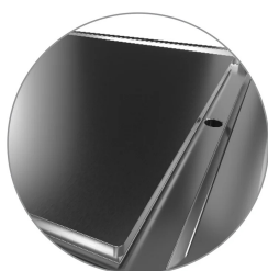
Plate not welded to the machine table with optimization of structural points subjected to thermal stress.

Floodable gutter for collecting cooking residue all around the perimeter of the plate easier cleaning, and better moisture retention of cooking food.