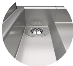
Table top with standardised tank and liquid drainage in the rear right-hand corner.

10 kW or 14 kW enameled cast-iron burners removable for easy cleaning.