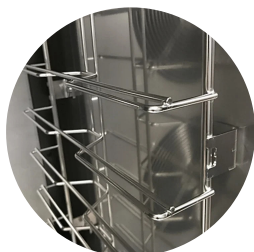
AISI 304 stainless steel plate-rack support, with removable ANTI-BRIEFING pairs of AISI 304 stainless steel rails, interlocking positionable every 20 mm for GN1/1 or 600x400.