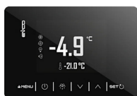
User-friendly digital control. Quick and intuitive is an aid in daily work.