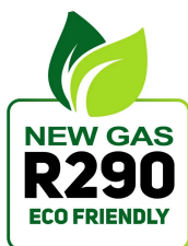
Thanks to the R290 gas supplied as standard for all available versions, Olis guarantees care and sustainability in all aspects of its product development.