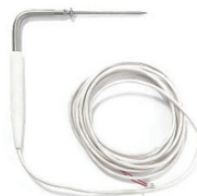
Heated core probe with 1 measuring point.