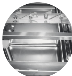
Stainless steel wash and rinse arms