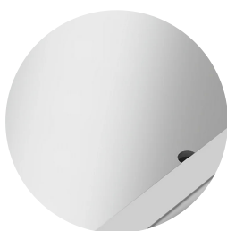
Plate welded to the hob that provides a larger cooking zone and eliminates dirt accumulation areas.

A 10-mm tilt of the plates toward the front of the machine allows for optimal grease outflow to the grease pan.