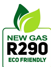
Thanks to the R290 gas supplied as standard for all available versions, Olis guarantees care and sustainability in all aspects of its product development.