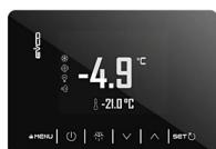
User-friendly digital control. Quick and intuitive is an aid in daily work.