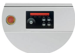
Electronic membrane control. Front-mounted, easy-access electrical panel.