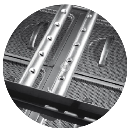
Stainless steel tank protection filters, easily removed without disassembling the wash arms, to keep the wash water free of heavy dirt and food residue